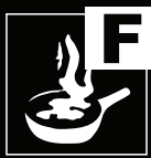
Cooking oil or fat